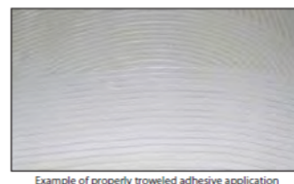
Example of properly troweled adhesive application